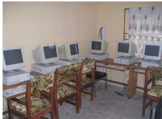
Bala Miller Hall