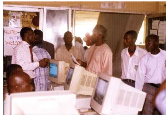
Some visitors at our stand