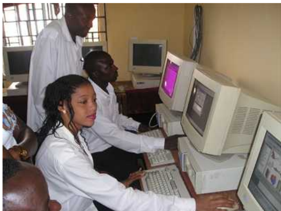
Visit from Scholars/ Staffs of private enterprises

The pensioners come on every Saturday of the month for 3 hours to receive FREE training as well.