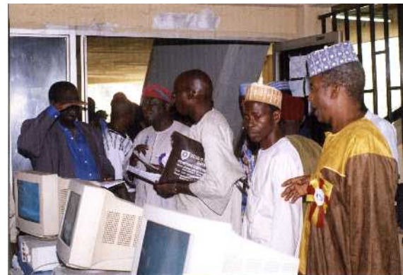
Visit by Elders