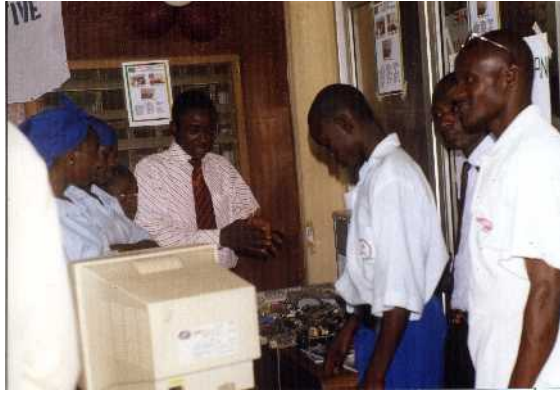
Visit from scholars of a secondary school